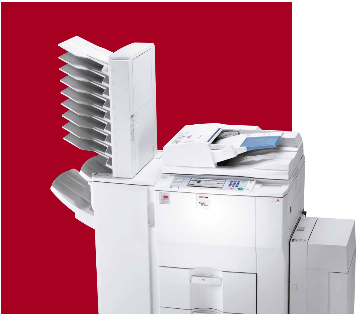
Aficio™ MP 5500/MP 6500